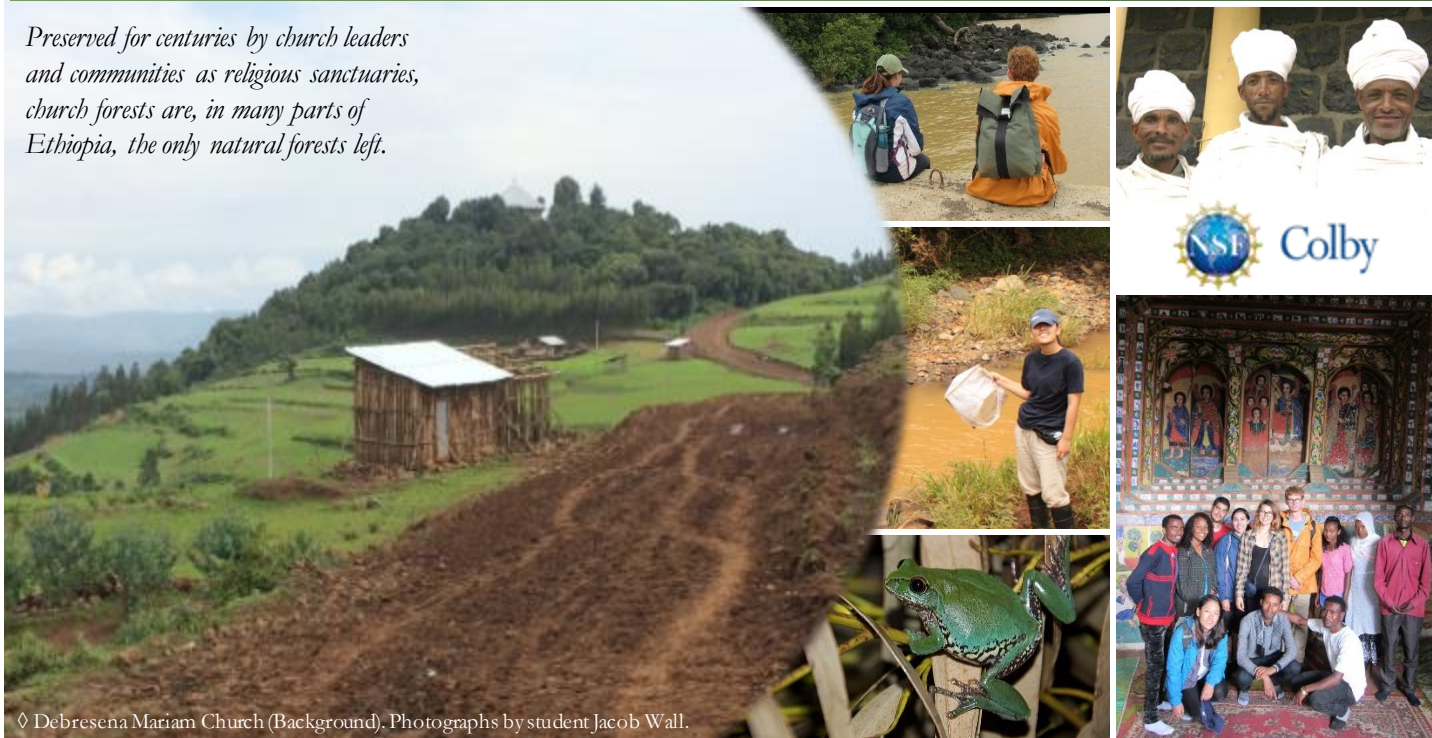
♦ Debresena Mariam Church (Background).

Preserved for centuries by church leaders and communities as religious sanctuaries, church forests are, in many parts of Ethiopia, the only natural forests left.