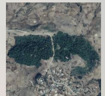
2014 Satellite image

Applications open December 1 st , 2016 Apply online at www.colby.edu/reu-in-ethiopia