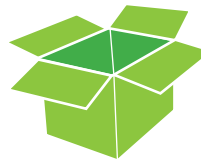
Non-soiled Paperboard (including cereal boxes)