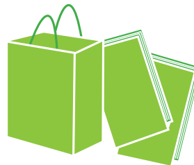
Paper bags, books