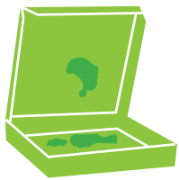
Greasy Pizza Boxes & Uncoated Paper Plates