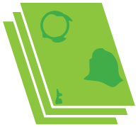
Soiled Paper & Napkins