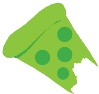
Food Scraps & Teabags No liquids allowed