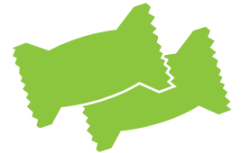
Wrappers & Packets